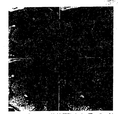
Figure 175-3. Posttreatment Na3MgEDTA ultrafast CT cardiac calcinearron scan

The multicomponent complexity of the pathophysio-logic atherosclerotic cascade, occurring in a given in-dividual in different stages at multiple sites, chal -lenges the potential therapeutic efficacy of highly targeted drugs.