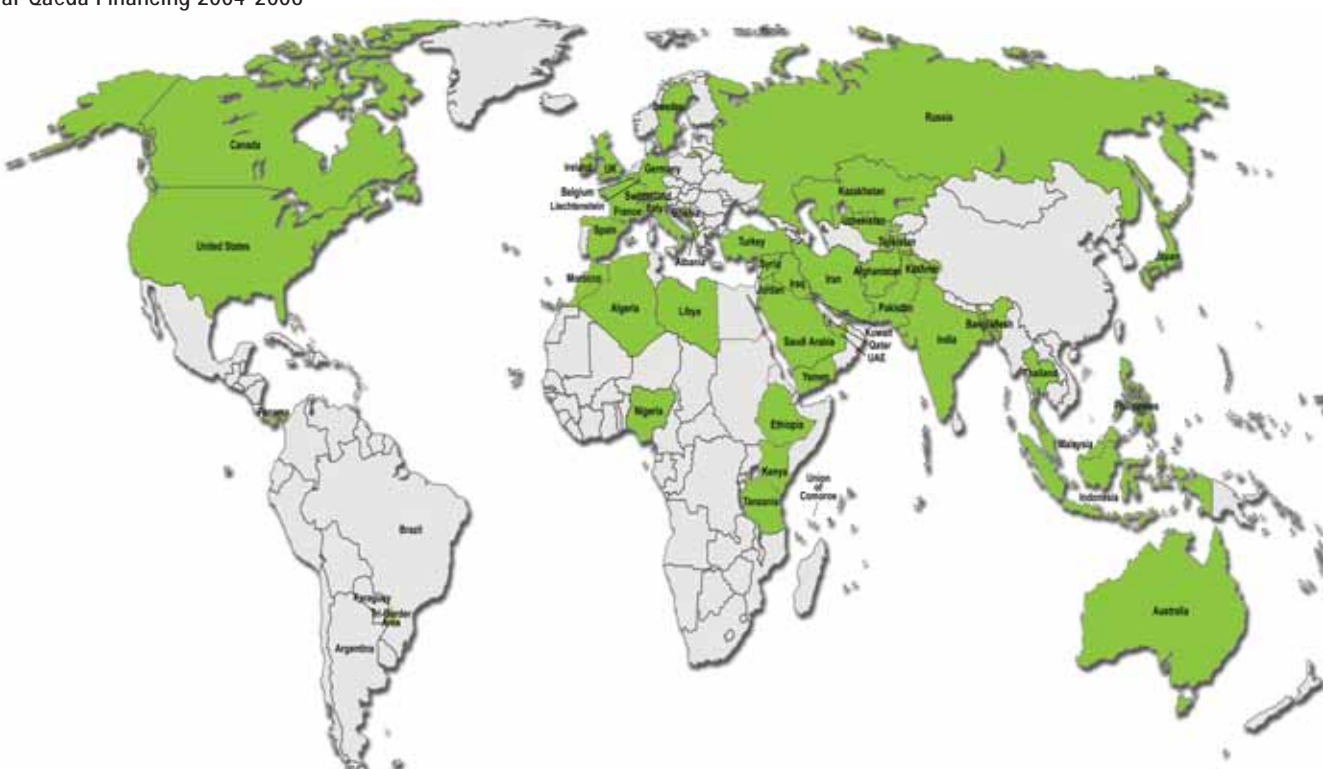
Map provided by the Investigative Project