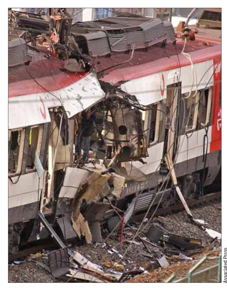
On March 11, 2004 devastating terrorist attack in Madrid, Spain killed 191 people.

Recent events demonstrate that Europe is not the only location where Islamic militants can establish themselves. There are legitimate concerns about the terrorist threats orchestrated by cells in Mexico or Canada, countries with whom we share some 5,000 miles of border. For many reasons, security along the border with Mexico has been a primary focus. However, the border to the north, which in many places is porous and unattended, must also be addressed. Disturbingly little attention has been paid to this 3,100 mile border despite the fact that terrorist groups have made previous attempts to enter the United States from Canada (the Millennium Plot). A Customs and Border Protection spokeswoman recently stated that "fewer than ten