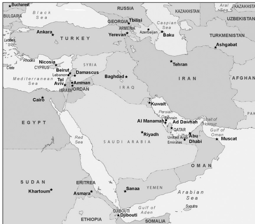
MAP OF THE MIDDLE EAST