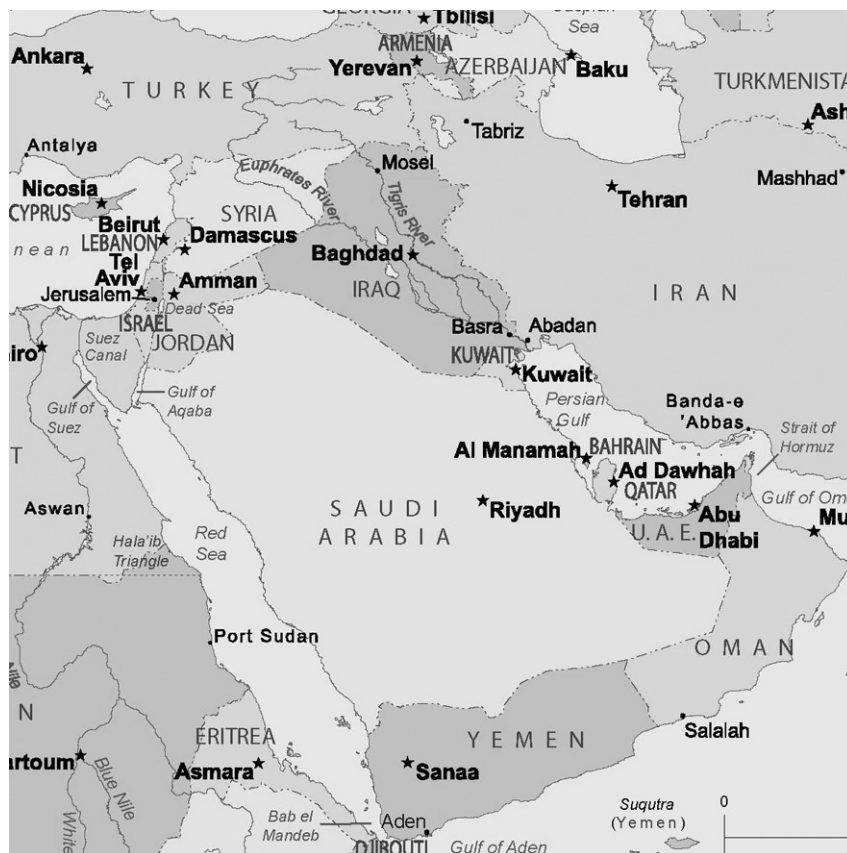
MAP OF ARABIAN PENINSULA AND VICINITY