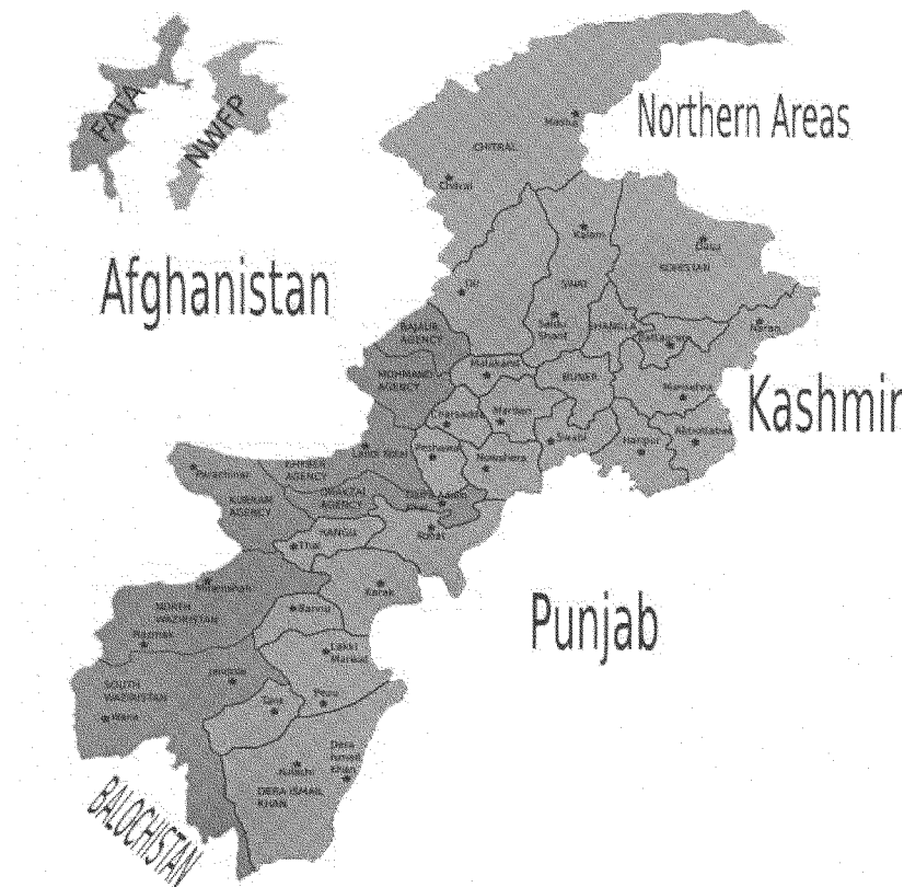
Figure 1: FATA and NWFP

While U.S.-led military operations reportedly eliminated 80% of al Qaeda's core leadership, Osama bin Laden, Ayman al Zawahiri, and other key leaders managed to escape across the mountainous border to Pakistan, finding a safe haven with Pashtun tribes. Since then, al Qaeda has rebuilt its command-and-control structure in concert with a host of entities, including tribal groups, Islamist parties, Kashmiri terrorist groups, criminal elements, corrupt police officials, and rogue factions in Pakistan's Inter-Services Intelligence (ISI). To understand how such a phenomenon could happen, it is important to understand the environment that exists in FATA and, to a lesser extent, the North-West Frontier Province (NWFP).