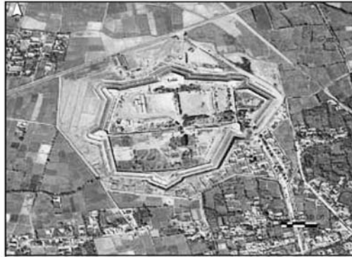
An Aerial View of Qala-i Jangi.

to 29 November, and U.S. SOF assisted the NA forces in quelling this revolt. The ad hoc reaction force—consisting of American and British troops, Defense Intelligence Agency (DIA) linguists, and local interpreters—established overwatch positions, set up radio communications, and had a maneuver element search for the trapped CIA agent. The agent escaped on the 25th. The next day, as the SOF reaction force called in air strikes, one bomb landed on a parapet and injured five Americans, four British, and killed several Afghan troops. The pilots had inadvertently entered friendly coordinates