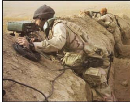
Two SOF operators identify targets.

Beside SF and AFSOC, other SOF combat multipliers made significant contributions to the liberation of northern and central Afghanistan. PSYOP leaflets offered rewards for fugitive Taliban and AQ leaders, informed the Afghan people about their pending liberation, and warned them of the dangers of unexploded ordnance and mines. Civil Affairs teams with TF DAGGER began assessing humanitarian needs