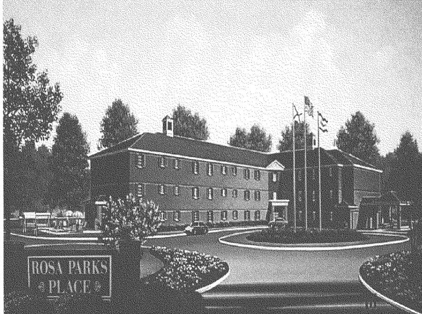
Alabama Multifamily Loan Consortium