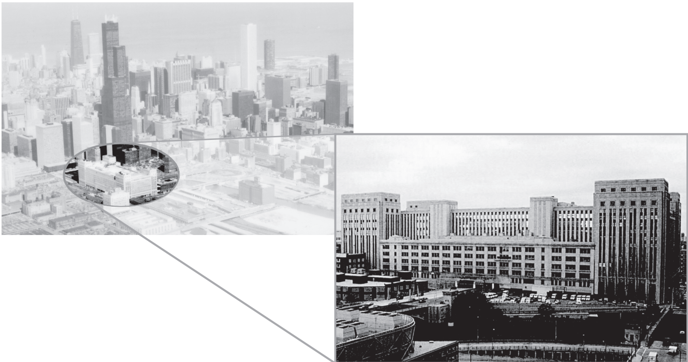
Figure 1: Example of Vacant USPS-Owned Property—the Former Main Post Office in downtown Chicago, Illinois

The former main post office building in Chicago, near the Sears Tower, is an example of a vacant USPS-owned property (see fig.1). USPS is currently incurring about $2 million in annual holding costs for this property, which was replaced by a new facility and vacated in 1997. Redevelopment of this property has taken several years because, according to USPS, the real estate market was weak and the City of Chicago and the developer have been unable to agree on terms. According to USPS, the property buyer is currently in negotiations with the City of Chicago regarding the property's redevelopment and the granting of certain tax exemptions from the City.