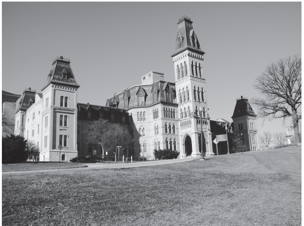
Figure 2: Example of Vacant VA-Owned Property—The Former Main Hospital Building on the Milwaukee, Wisconsin, Health Facility Campus

from inpatient to outpatient services. Subsequently, VA has struggled to reduce its large inventory of buildings, many of which are underutilized or vacant. In August 2003, we reported that VA had 577 vacant and underutilized properties. Figure 2 shows an example of a vacant VA-owned property in Milwaukee, Wisconsin.