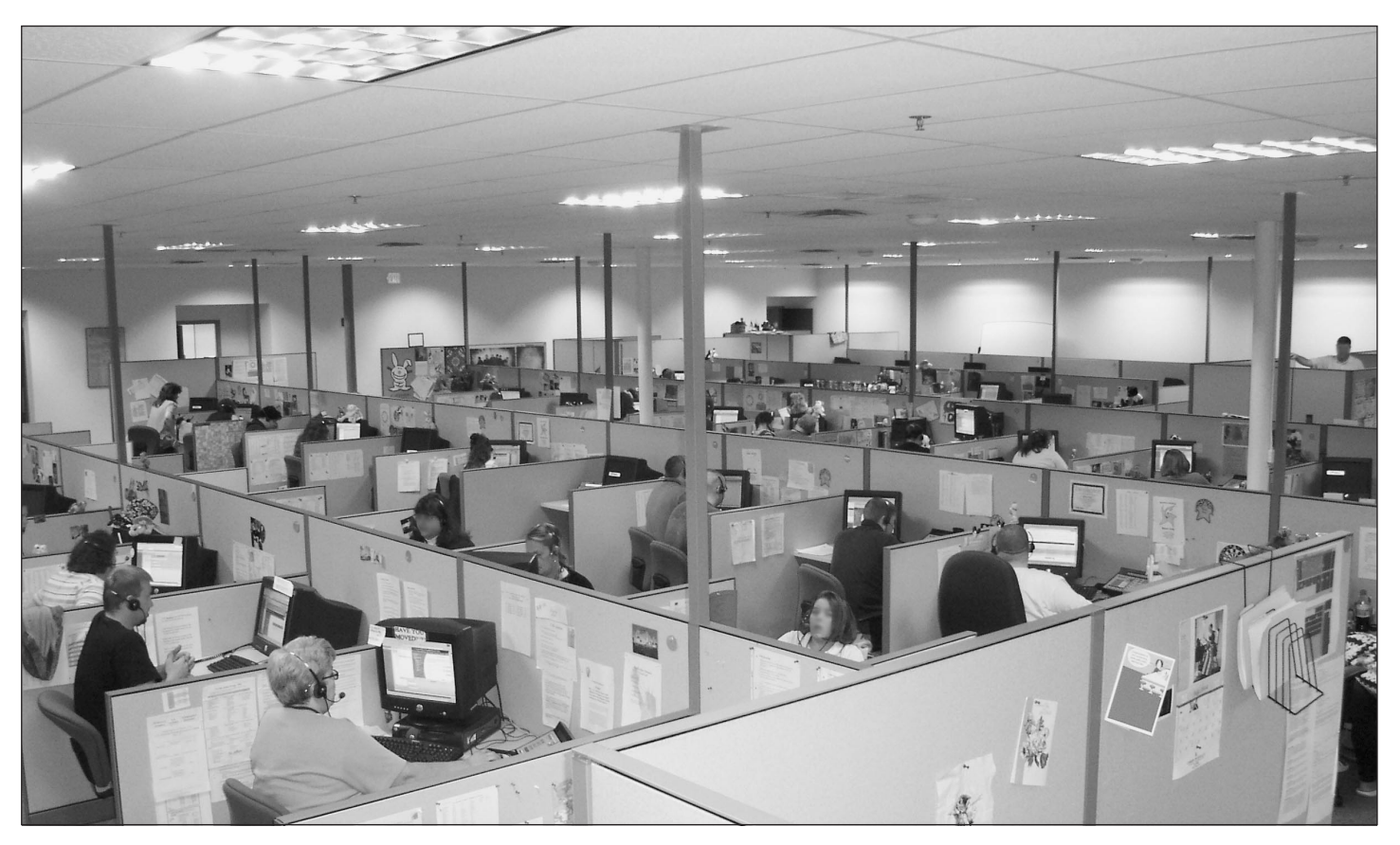
Figure 2: Tier 1 Customer Service Representatives Processing Immigration-Related Calls at a Contractor-Operated Call Center

centers employed over 450~\mathrm{CSRs.}^7 Figure 2 shows CSRs processing calls at a Tier 1 call center.