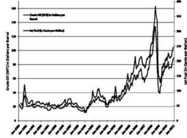
Fig. 2 Fuel Price Trends (EIA, ATA)

The system has run well in the past few years, although this cannot yet be attributed to NextGen. The accident rate and delays (Figure 3) are both down over the past 2 years although we are still experiencing congestion at the large hubs. This is, in part, a result of the reduction in the number of flights due to high fuel prices (Figure 2) and the weak economy. While the FAA has done a better job at managing delay in the system, it is likely that delay will increase as the economy strengthens and traffic levels rise.